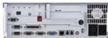
▲ Advanced connectivity

TOSHIBA TEC delivers new features in the ST-7000 which are designed to lower the total cost of ownership (TCO). Retailers can utilise and protect their investment in existing PoS peripherals and with powered USB available, have a 'future-proof' hardware platform to cater for the ever changing needs of the retail business. The system is designed for easy installation, requiring just a single power outlet. The new powered USB ports make it easy to connect or replace PoS peripherals and the slide out modules (SOM) are designed to minimise down-time, reduce the overall cost of maintenance and improve checkout productivity.